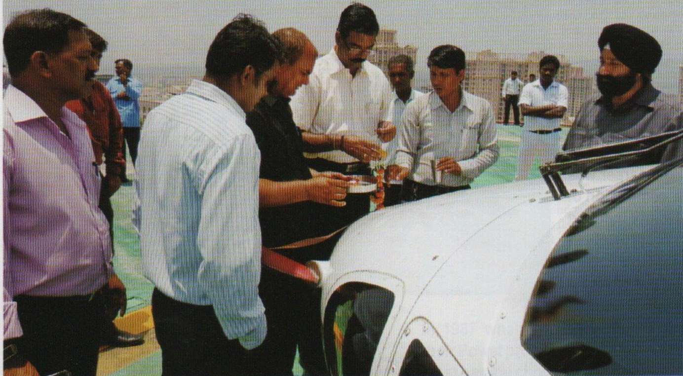
Pooja of Helipad and Helicopter conducted recently at Powai.