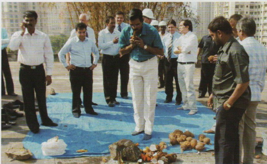
Bhoomi Pooja at a construction site

"Being in the construction line, I feel happy that through the contractors our company has been giving employment to many poor people at project sites and this has improved their living conditions. They are able to send their children to school and provide them education. It has improved their standard of living and some of them have been able to buy a home for themselves."